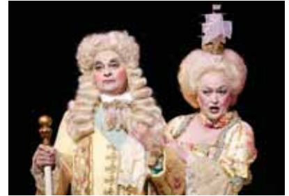
ACT II of Opera Australia's 'The Gondoliers'.