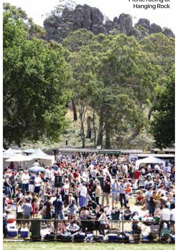
Picnic racing at Hanging Rock

Have a look at Mornington on January 6, Cranbourne on the 11th. Or why not head for Warrnambool on the 14th, Kilmore on the 21st and Hanging Rock for Australia Day on the 26th. For a full list go to www.countryracing.com.au